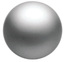
Matt Titanium REF. C0004TCSTIT-135