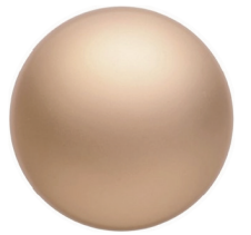
Matt Purple Gold Intense REF. C0002TVIS-70