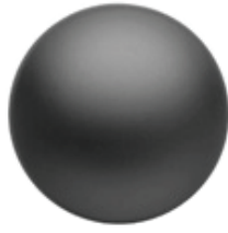
Matt Metal Black REF. C0002TMBS-10