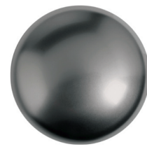
Eclipse Velour REF. C0004TCVECL-137