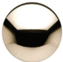
Shiny Extra Light Gold REF. C0002TXLL-23