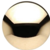
Shiny Light Gold REF. C0002TOLL-17