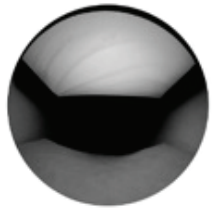
Shiny Metal Black REF. C0002TMBL-09