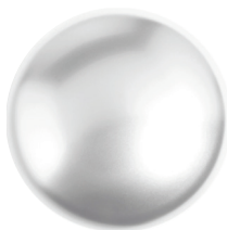
Real Silver Velour REF. C0002TARL-38