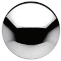
Shiny White Bronze REF. C0002TBBL-03