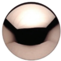
Shiny Sahara REF. C0002TSHL-13