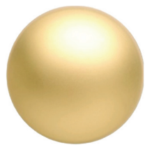
Matt Standard Gold REF. C0002TOSS-20