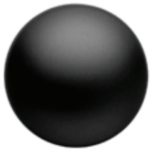
Matt Eclipse REF. C0004TCSECL-138