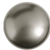
Graphite Velour REF. C0002TGVE-30