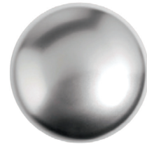
Titanium Velour REF. C0004TCVTIT-134