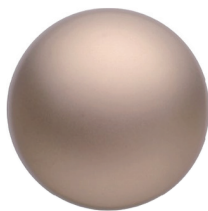
Matt Sahara REF. C0002TSHS-14