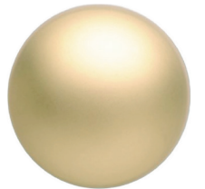
Matt Light Gold REF. C0002TOLS-18