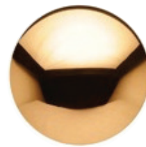
Rose Gold 2 REF. C0002TOR2-22