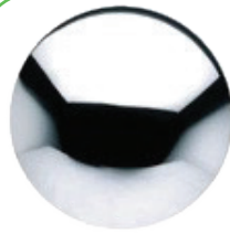
Shiny Ice Chrome REF. C0004TCLICE-130