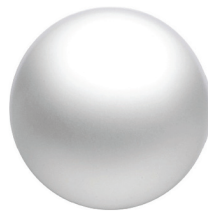
Matt Real Silver REF. C0002TARL-39