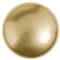
Standard Gold Velour REF. C0002TOSV-35