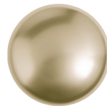
Light Gold Velour REF. C0002TOLV-34