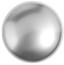
White Bronze Velour REF. C0002TBBV-26