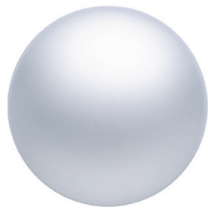
Matt Chrome REF. C0004TCSA-02