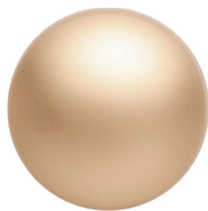
Matt Purple Gold REF. C0002TOVS-66