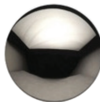
Shiny Graphite REF. C0002TGLU-11