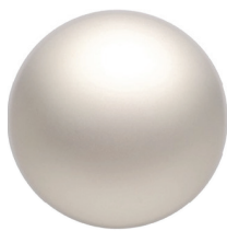
Matt Nickel REF. C0004TNLS-06