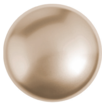
Purple Gold Velour REF. C0002TOVV-65