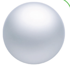
Matt Ice Chrome REF. C0004TCSICE-132