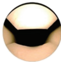
Shiny Coral REF. C0002TCOL-15