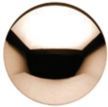
Shiny Purple Gold REF. C0002TOVL-64