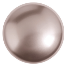
Sahara Velour REF. C0002TSVE-31