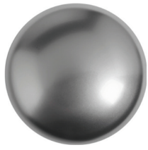
Metal Black Velour REF. C0002TMBV-29