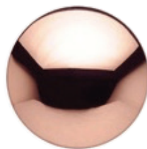
Rose Gold 1 REF. C0002TOR1-21