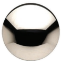
Shiny Nickel REF. C0004TNLU-05