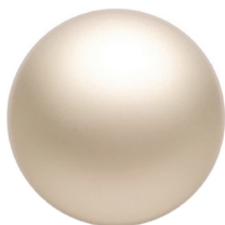
Matt Extra Light Gold REF. C0002TXLS-24