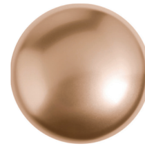
Purple Gold Intense Velour REF. C0002TVIV-69