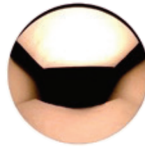
Shiny Purple Gold Intense REF. C0002TVIL-68