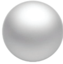
Matt White Bronze REF. C0002TBBS-04