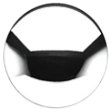
Shiny Real Silver REF. C0002TARL-37