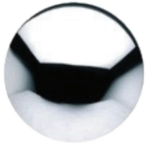
Shiny Chrome REF. C0004TCLU-01