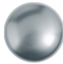
Ice Chrome Velour REF. C0004TCVICE-131