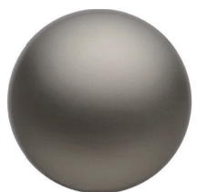
Matt Graphite REF. C0002TGSA-12